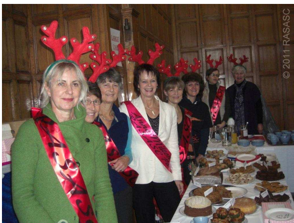
RASASC volunteers at the cake-stand inside the Guildhall with (centre) Anne Milton MP.